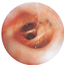
Previous Model BF-MP160F