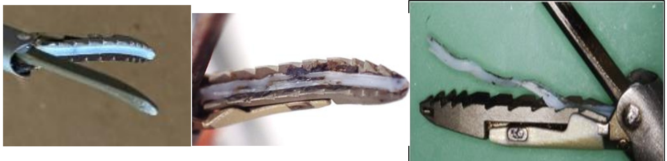
Figure 2. Example Correct Thunderbeat Probe (Left), Tissue Pad Deformation (Center), Tissue Pad Detachment (Right)